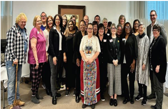
Spring Ontario Federation Meeting